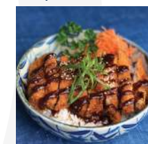
chicken katsu don