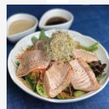
aburi salmon salad