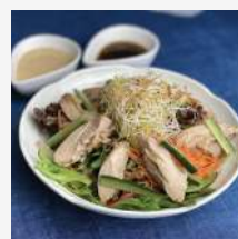
teriyaki chicken salad