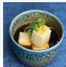
age dashi tofu