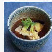
age dashi eggplant