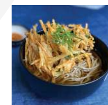
soba tempura vege