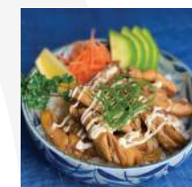
teriyaki chicken don