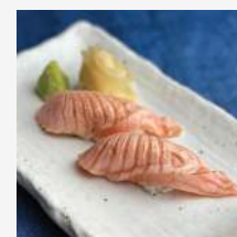
aburi salmon nigiri