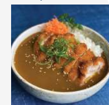
chicken katsu curry