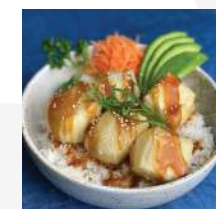
teriyaki tofu don