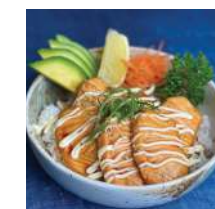
teriyaki salmon don