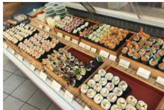
all sushi gluten and dairy free