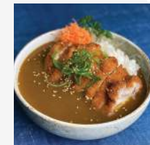
chicken katsu curry