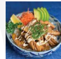
teriyaki chicken don