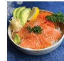
salmon sashimi don