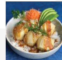
teriyaki tofu don