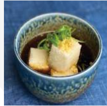
age dashi tofu