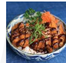
chicken katsu don