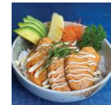
teriyaki salmon don