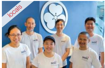
The Sushi Wave Team