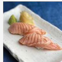
aburi salmon nigiri