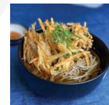
soba tempura vege