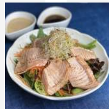
aburi salmon salad